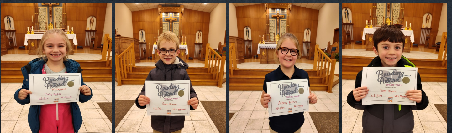
Daisy read 100,000 words, Owen read 300,000 word, Aubrey read 400,000 words and Sam read 500,000 words.