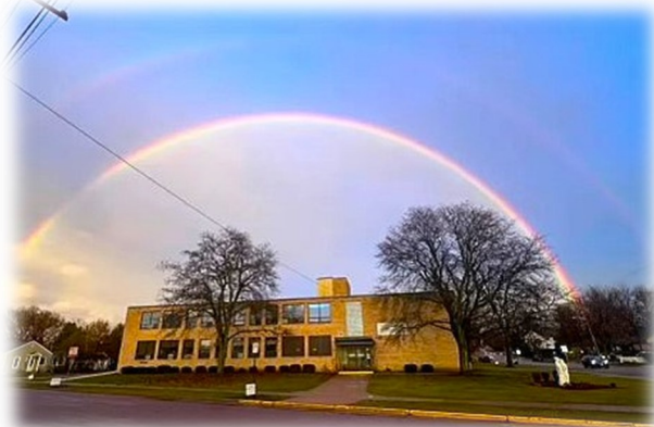
Beautiful double rainbow was captured over Assumption on Tuesday, Nov 5th. I set My rainbow in the cloud, and it shall be the sign of the covenant between Me and earth. Genesis 9:13