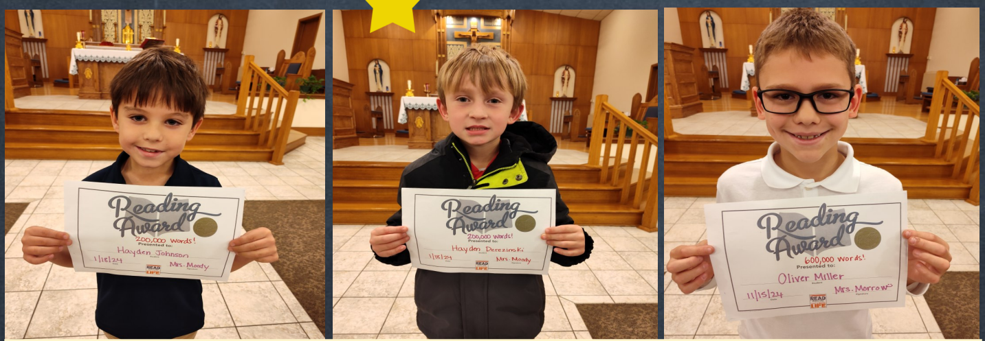
Hayden J. and Hayden D. read 200,000 words. Oliver read 600,000 words.