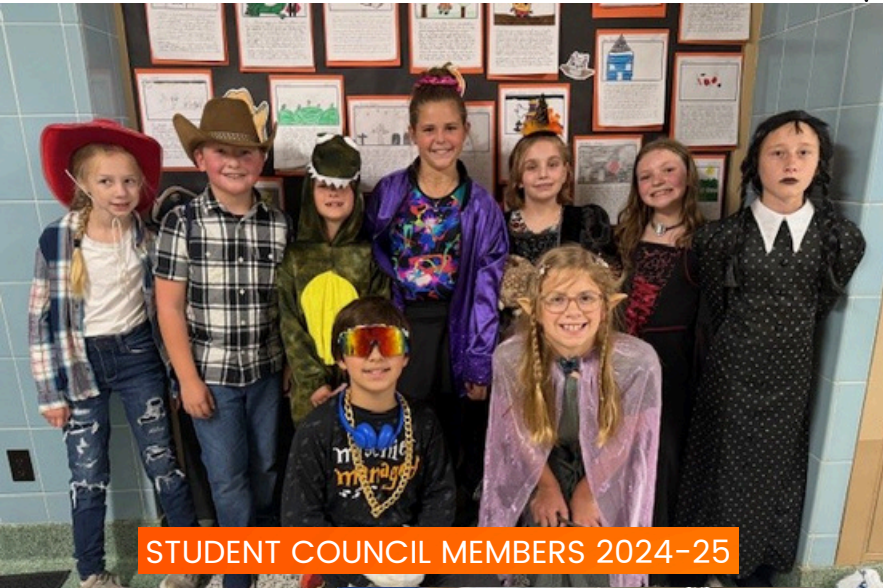
STUDENT COUNCIL MEMBERS 2024-25