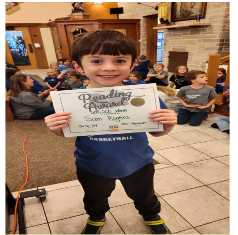
Grayson read 300,000 words, Owen read 400,000 words, Sam read 600,000 words.